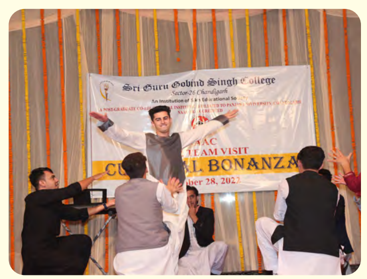
Karsak Dance performance by students of Afganistan

• 02 activities (National Dance Performances) were the highlights of the session 2022-23.