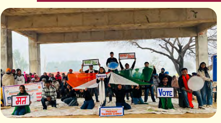
Nukkad Natak on' Sabki Vote Sabka Vikas' performed at Tasoli village to commemorate National Voters Day