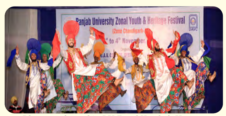
Bhangra - Second in PU Zonal Youth & Heritage Festival~2022-23