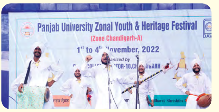
Folk Dance - Second in PU Zonal Youth & Heritage Festival 2022-23