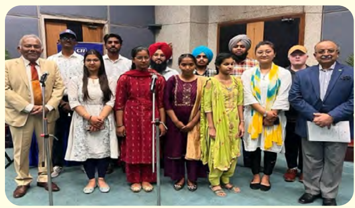
Visually Impaired students presenting National Anthem at Chandigarh Annual Sesson 2022-23 organised by CII students to help them appear in their university exams.

The Equal Opportunity Cell has been constituted to facilitate creative interaction and promotion of equality among all the students belonging to different social categories. The cell helps to promote diversity, equality, and inclusion among the students within the campus. The cell acts as a mediator between the pool of volunteer writers and the visually impaired