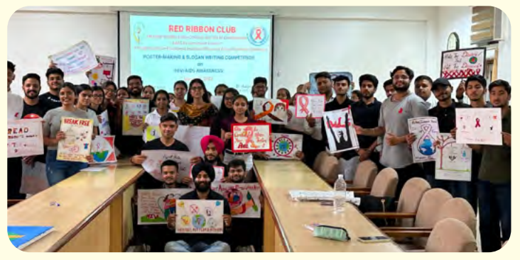
Poster Making & Slogan Writing Competition on HIV/AIDS Awareness