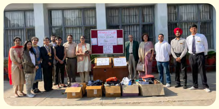
Donation Drive for needy people and adopted animals organised by SGGS Rotaract Club