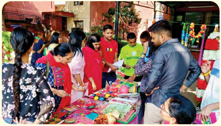
Stalls of Phulkari, Mud Diya, Candles and Festive Decor items to promote Women Entrepreneurship in collaboration with MGNCRE GOI