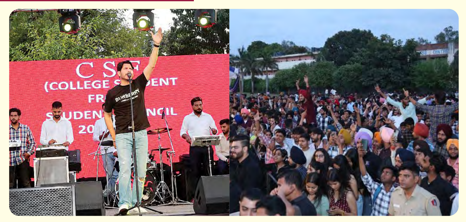
Punjabi Singer Jass Bajwa performing at 'Lishkara 2023'- A Two Day Sports and Cultural Extravaganza