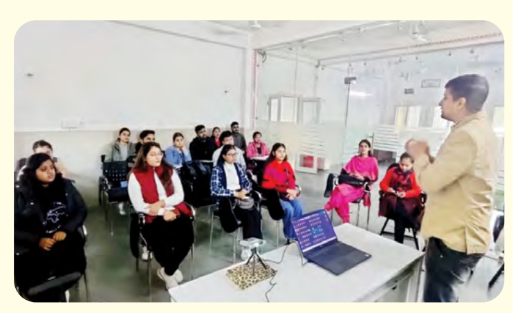
Visit to Pre-Incubation Centre of TBI-IISER, Mohali by IIC of the College