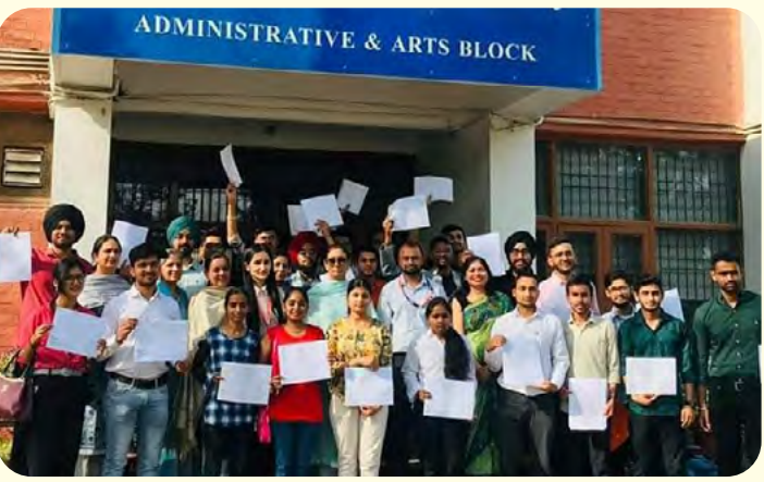
Campus Placement Drive 2022-23 by Piramal Finance Sales and Service Pvt. Ltd

The Training and Placement Cell of the College not only maintains contact with distinguished organisations and industrial enterprises, but also efficiently delineates the career counseling opportunities for students. It has been continuously