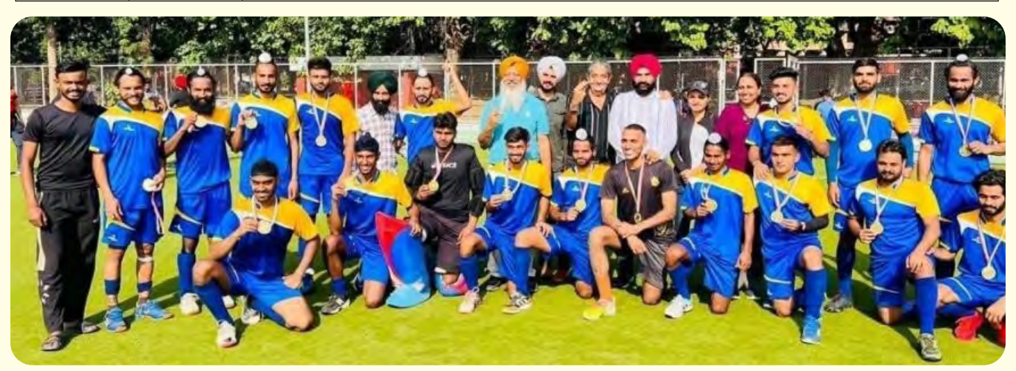
Winners\ of\ Panjab\ University\ Inter-College\ Hockey\ Championship