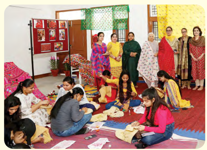
One Day Inter-College Workshop on 'Heritage and Art and Craft Items'

An exhibition showcasing the diverse Heritage and Culture of Punjab was organised on Nov 28, 2023. A range of items reflecting Punjab's culture and heritage were displayed like Phulkari, Bagh, Dari, Dasuti, Decoration pieces and other