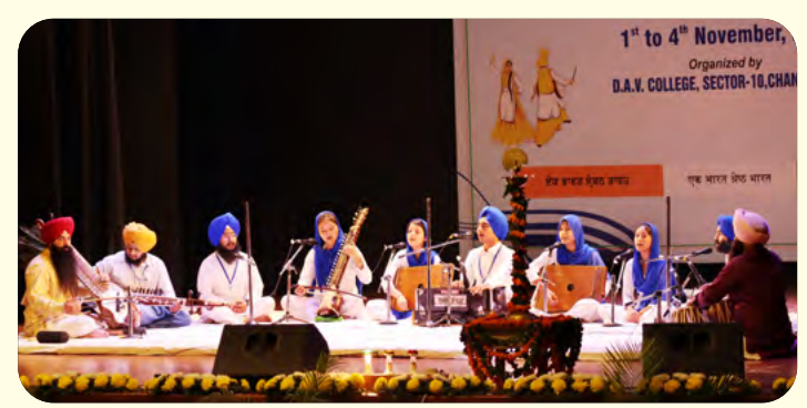
Group Shabad Team- Third in PU Zonal Youth & Heritage Festival 2022-23