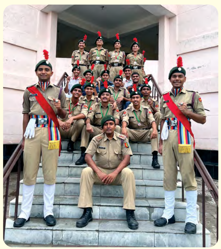
Regiment, Chandimandir from Jul 15-31, 2022. 10 NCC Cadets of the College participated in the Army Attachment Camp organised by Sikh Regiment at Chandimandir from Aug 08-22, 2022.