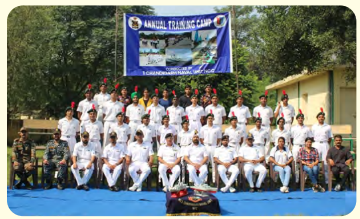
The cadets participated in the following activities during the session:

The National Cadet Corps (NCC) provides opportunities for the youth to develop a sense of duty and discipline and provides a platform to take part in a wide range of activities, such as annual training camps, adventure camps, national camps, ship attachment camps, Boating, water sports, scuba diving and many other social awareness Programmes. NCC Naval wing of the College enrolled 50 cadets in the session 2022-23.