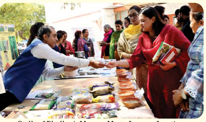
Stalls of Phulkari, Manure Mart, Jaggery Junction, Handicraft Hub & Millet Meals at Campus Bazaar to promote Entrepreneurship & support Student Self-Help Groups