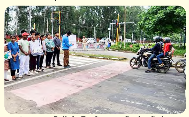
Awareness Rally by Eco Scouts to Combat Carbon Footprint to commemorate World Ozone Day

students, and the wider community, the society plays a pivotal role in cultivating a shared understanding of environmental issues and fostering a sense of collective responsibility towards safeguarding our planet. In essence, the Dharat Suhavi Environment Society's efforts serve as a catalyst for positive change, inspiring individuals and communities to embrace environmentally sustainable practices and work towards a more harmonious relationship with the natural world. Through its advocacy and outreach activities, the society demonstrates a steadfast commitment to building a sustainable future for our planet.