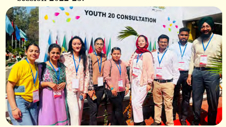
Prize Winning Students at Youth 20 Consulation Panjab University G20 Youth International Seminar

06 Workshops, 03 Expert Lectures, 01 Educational Visit, 01 Start up, 02 Competitions and 01 Awareness Programme were organised in the session 2022-23.