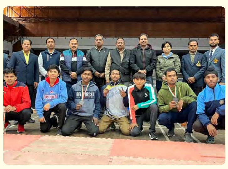
Winners\ of\ Panjab\ University\ Wushu\ Championship