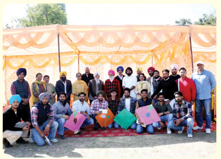
Winners of Inter-College Kite Flying Competition Feb 13, 2023

A total of 27 teams from colleges of Tricity participated with great enthusiasm. GGDSD College - 32, displaying efficiency, dexterity and skill, won the first prize and a cash prize of Rs 5000/, DAV College - 10 got the second position and a cash prize of Rs 3000/- and SGGS College - 26, Chd won the third prize along with a cash prize of Rs 2000/-. A friendly competition was also organized between the alumni and the faculty members.