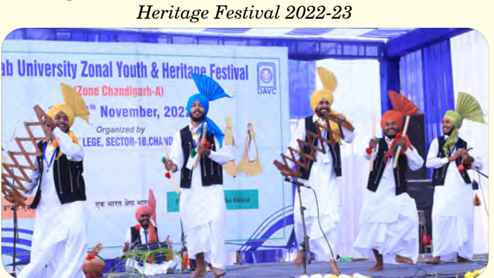
Folk Orchestra - Third in PU Zonal Youth & Heritage Festival 2022-23