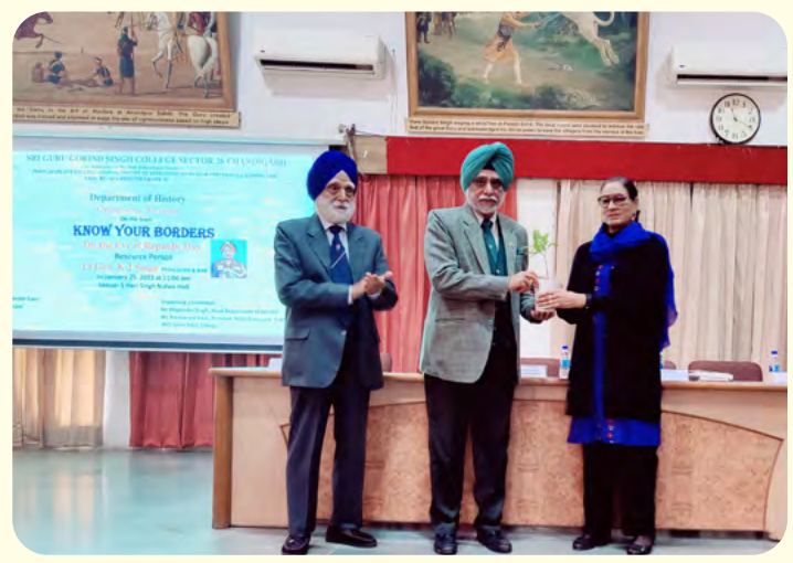
Lt Gen KJ Singh being felicitated at the Seminar on 'Know Your Borders' on Jan 25, 2023

The Resource Person Lt Gen KJ Singh-VSM, AVSM and BAR acquainted the students with the detail study of the borders. The boundaries between India and adjacent countries before partition and after partition, their significance, problems faced by the