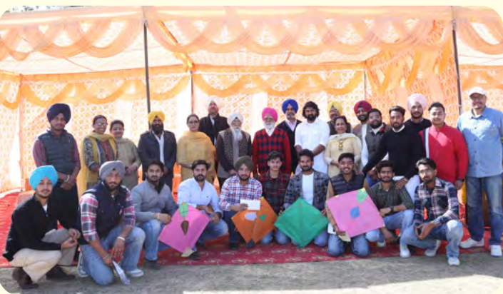
Winners of Inter-College Kite Flying Competition held to celebrate the festival of Basant Panchmi