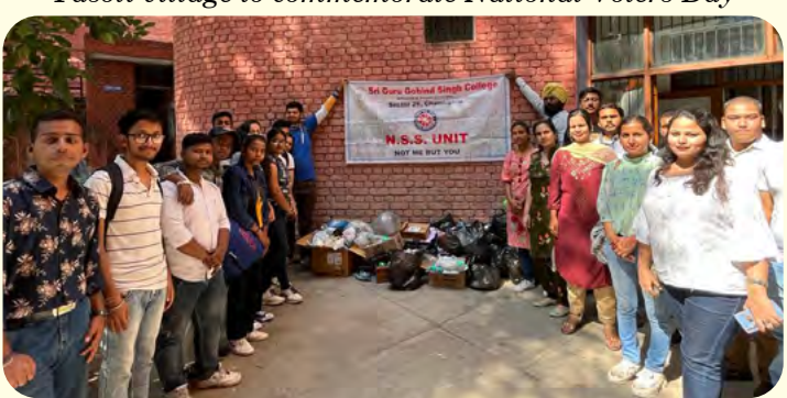
Plastic Waste Collection Drive by NSS Unit in collaboration with Municipal Corporation, Chandigarh