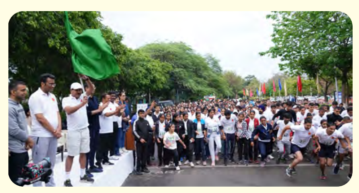
Volunteers in Marathon for LIFE- Lifestyle for Environment, by EIACP, Department of Environment, Chd Administration