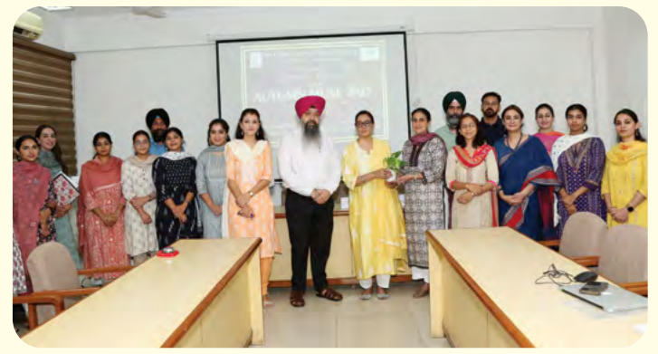
Autumn Muse-2022 Sep 02, 2022

The Literary Competition was conducted in six categories including Debate, Elocution, Poetry Recitation, Poetry Writing, Essay and Short Story Writing. The event witnessed an overwhelming participation from 94 students. The winners were awarded certificates.